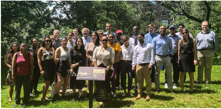
In honor of Juneteenth, members of the Weil family participated in a guided tour of Seneca Village in Central Park.