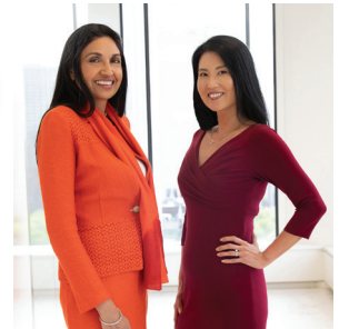
AAPI Leaders for Change

We invite you to learn about Weil's purposeful investments within our Firm and in broader society to achieve racial justice and equity.