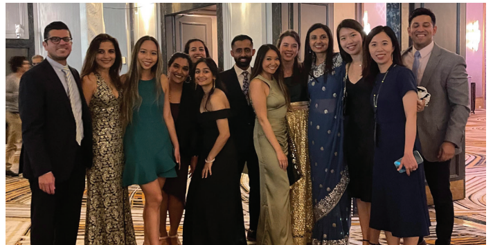
SABA 2022 Conference

Weil also sponsors a number of other non-profits and bar associations, including Asian Pacific American Bar Association Educational Fund (AEF); Muslim American Bar Association (MUBANY); National Asian Pacific American Bar Association (NAPABA); and South Asian Bar Association (SABA).