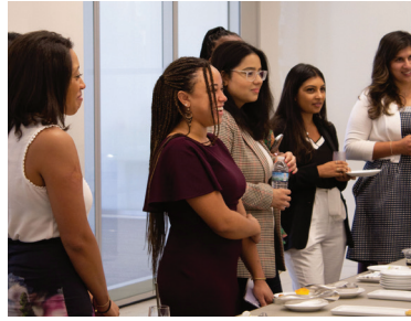
Women of Color Breakfast New York