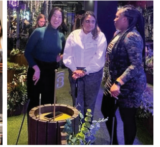
Pan Affinity New Associate Welcome at Swingers