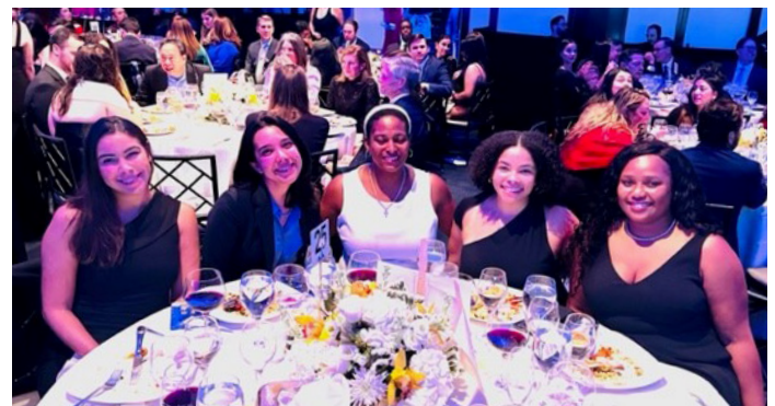
Weil Latinx attendees at the 2022 Latino Justice 50th Anniversary Gala Awards in NYC.