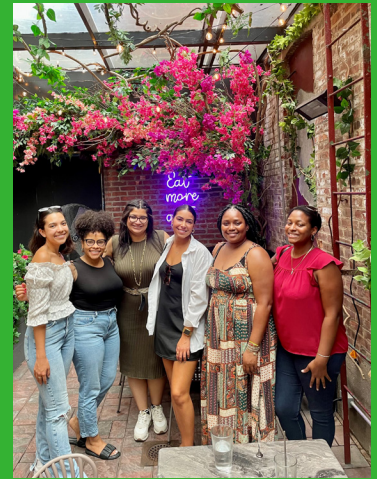
Summer Soiree Latinx Brunch at The Black Ant.

Throughout summer , the Latinx group hosted several events including an ice cream social and a reception at Amali. WeilLatinx hosted virtual events and virtual networking opportunities for summer associates, including a cheese and beer tasting.