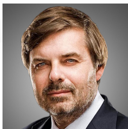
JEAN-DOMINIQUE DAUDIER DE CASSINI