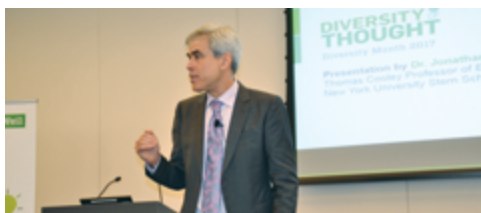
Jonathan Haidt – Ideological Diversity