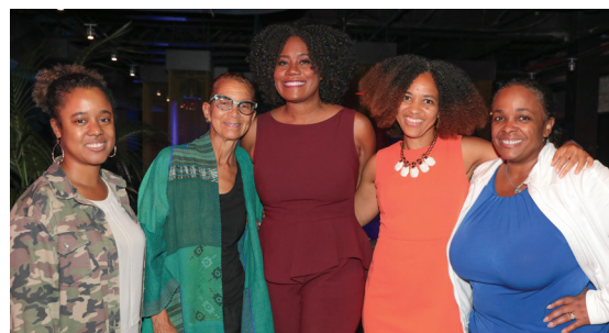
BLAST Alumni Reception 2022

Basquiat Exhibit followed by a Reception after the event. Summer Program 2022. (pictured left)