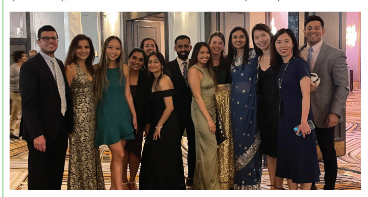
SABA 2022 Conference

Weil also sponsors a number of other non-profits and bar associations, including Asian Pacific American Bar Association Educational Fund (AEF); Muslim American Bar Association (MUBANY); National Asian Pacific American Bar Association (NAPABA); and South Asian Bar Association (SABA).