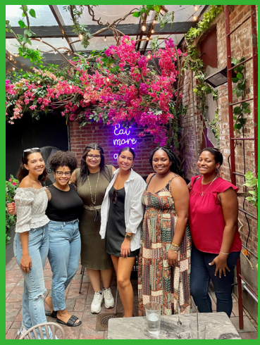
Summer Soiree Latinx Brunch at The Black Ant.

Throughout summer, the Latinx group hosted several events including an ice cream social and a reception at Amali. WeilLatinx hosted virtual events and virtual networking opportunities for summer associates, including a cheese and beer tasting.